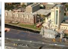
LeadX for facility buildings Norfolk Naval Shipyard Virginia