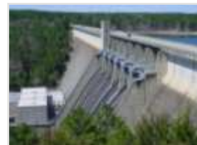
LeadX for park structures US Army Corps of Eng. Arkansas

Find Data Sheet, SDS and more at www.syneffex.com