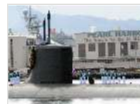
LeadX for facility buildings Pearl Harbor Naval Base Hawaii

LeadX™ has been the chosen and trusted choice for remediation of lead contaminated surfaces by the U.S. Navy, U.S. Army Corps of Engineers, Child & Family Services, the American Red Cross, and many others. Its unique clear coat formula bonds with the surface and prevents lead leaching through to the surface. Additionally, the coating is moisture, mold, and UV resistant, offering superior surface protection.