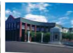
LeadX for historic renovation Susan B Anthony Voters Block New York