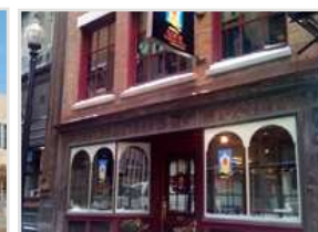
LeadX for safe stairwells Torit Language School Massachusetts