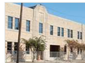
LeadX for office renovation American Red Cross Central Louisiana